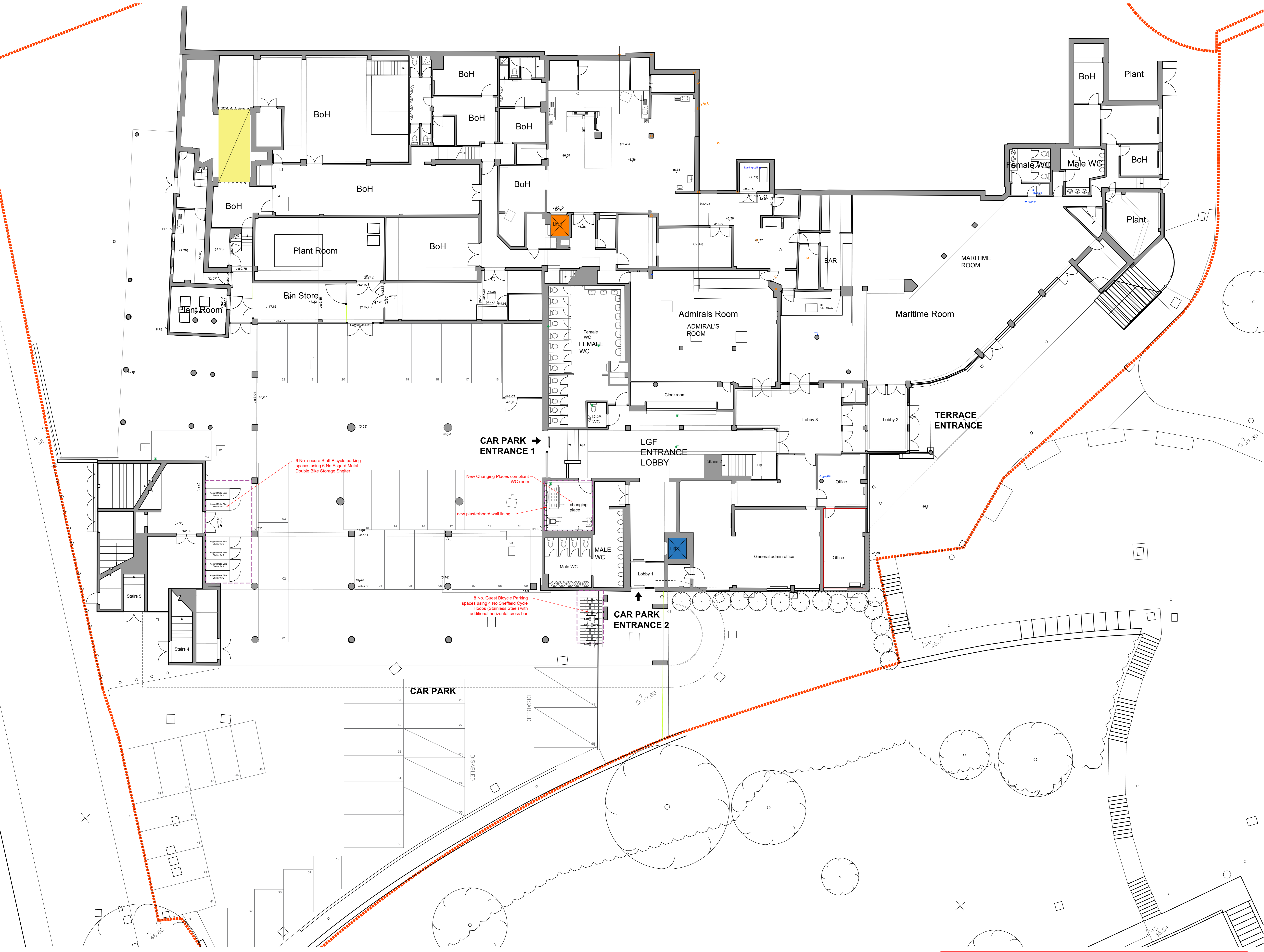
Lower Ground Floor GA Plan 1:100 at A0

Materials and workmanship Any building work to be carried out with proper materials and in a workmanlike manner in accordance with regulation 7 of the Building Regulations. The builder may show compliance with regulation 7 in a number of ways including the appropriate use of a product bearing CE marking in accordance with the Construction Products Directive (89/106/EEC) as amended by the CE Marking Directive (93/68/EEC) or a product complying with an appropriate technical specification (as defined in those Directives), a British Standard or an alternative national technical specification of any state which is a contracting party to the European Economic Area which in use is equivalent, or a product covered by a national or European certificate issued by a European Technical Approval issuing body, and the conditions of use are in accordance with the terms of the certificate.